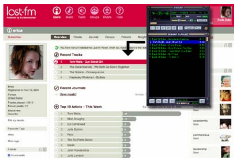
Figure 5 : After installing an Audioscrobbler plugin for your media player (eg: Winamp,) information about every song you listen to on your computer is sent to Last.fm to update your profile.