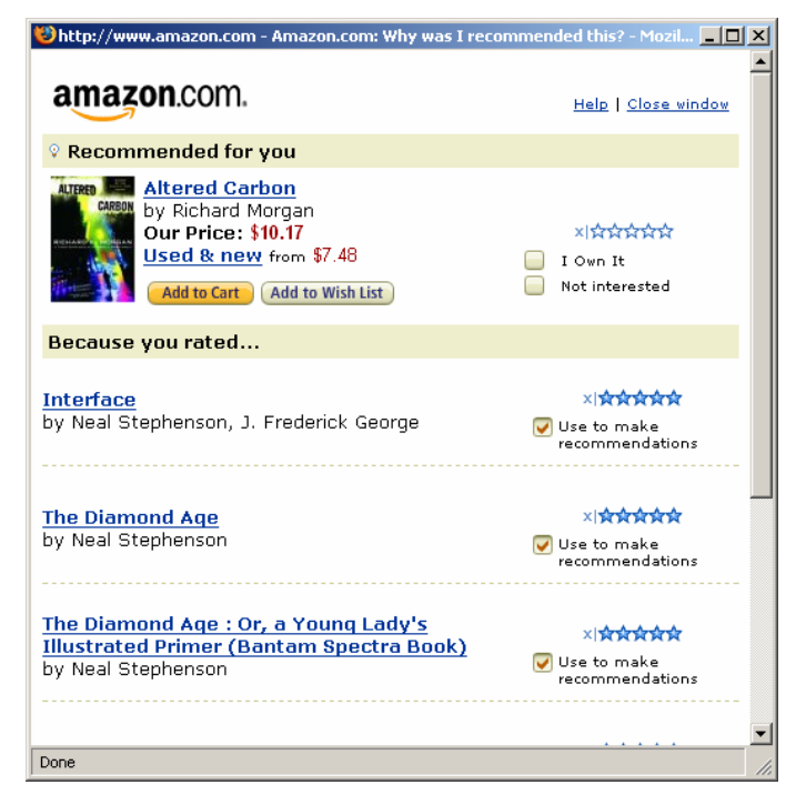
Figure 4 : Amazon.com provides customers with list of previous purchases and ratings that strongly influenced a particular recommendation.

that you made that strongly influenced the recommendation at hand (Figure 4). Explanations of CF recommender systems are challenging because the underlying predictive models are complex aggregations of large quantities of data, often with significant probabilistic reasoning. Yet initial research suggests that users are overwhelmed if they are presented with too much data within an explanation [23]. While the current work on recommendations is far from conclusive, promising approaches that have been explored include: showing histograms of a user's neighbors' ratings for the recommended item and showing key items that the user rated that influenced the recommendation.